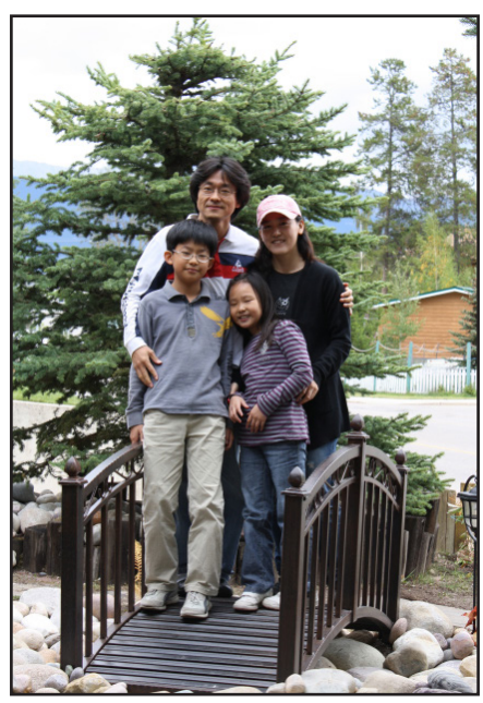
Family from Korea with Elementary Students in Jasper for Two Years