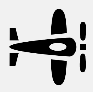
Developing an Aviation Career Pathways Program for Parkland and Grand Trunk High School Students