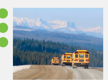
Principal and Central Office Team Working Committee to review School Attendance and Boundary Areas in Hinton and Edson