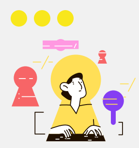
Preparation for Principal Retreat