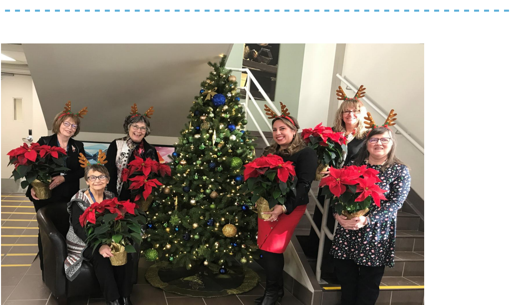
We wish you the very best the season has to offer and Happy New Year!