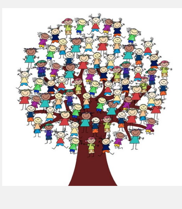
Support Board Policy Committee Work, Trustee Book Study, and Board Advocacy