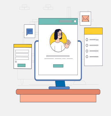
High School Leadership Team Strategic Planning Symposium

Analysis of Division Education Survey Results