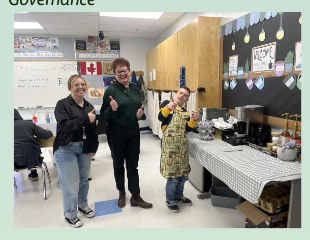
Visiting the ACEs classroom and new Coffee Bar Learning Centre at PCHS

Board Goal 9, Continue to visit and be visible in schools SLQS Competencies 1, Building Effective Relationships; 2, Modeling Commitment to Professional Learning; 3, Visionary Leadership; 4, Learning Learning: 7, Supporting Effective Governance