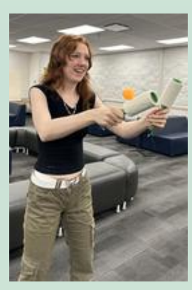
SYC at HCHS